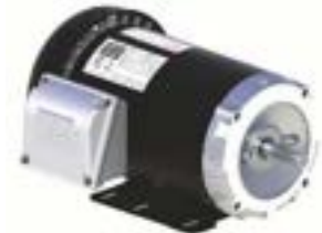
TEFC Three Phase