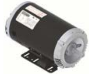
ODP Three Phase