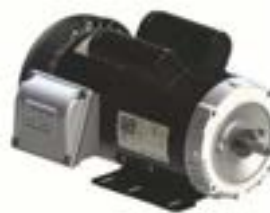
TEFC Single Phase