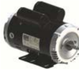
ODP Single Phase